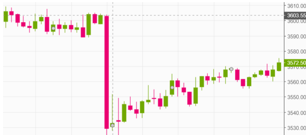
BTCUSD- 15 m Candlestick Chart